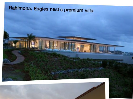
Rahimoana: Eagles nest's premium villa