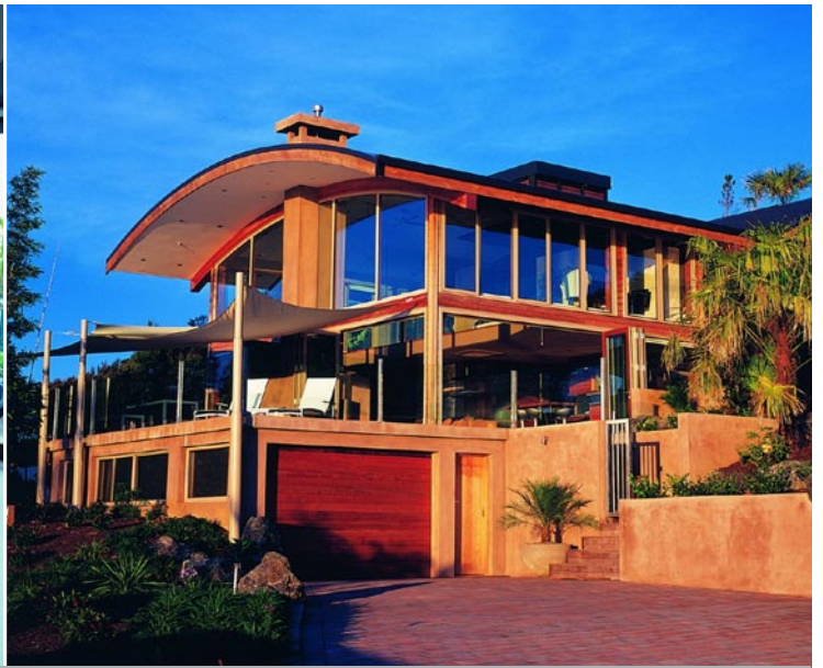
FIRST LIGHT TEMPLE Hidden away amongst the trees, this elegantly simple one-bedroom villa is a favourite with honeymoon couples or those looking for a romantic break