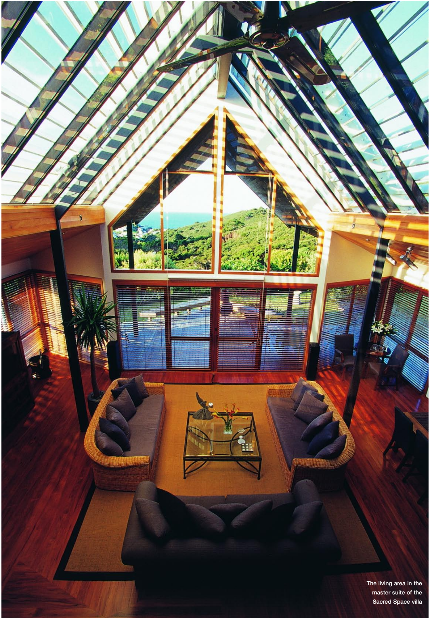
The living area in the master suite of the Sacred Space villa