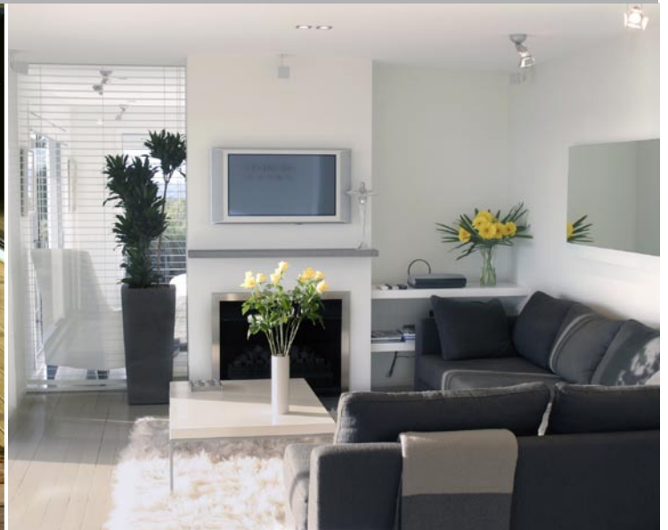
THE EYRIE With its expansive outdoor living areas The Eyrie is well-suited to families and groups of friends. From its hilltop location, there are sweeping views across the Bay of Islands