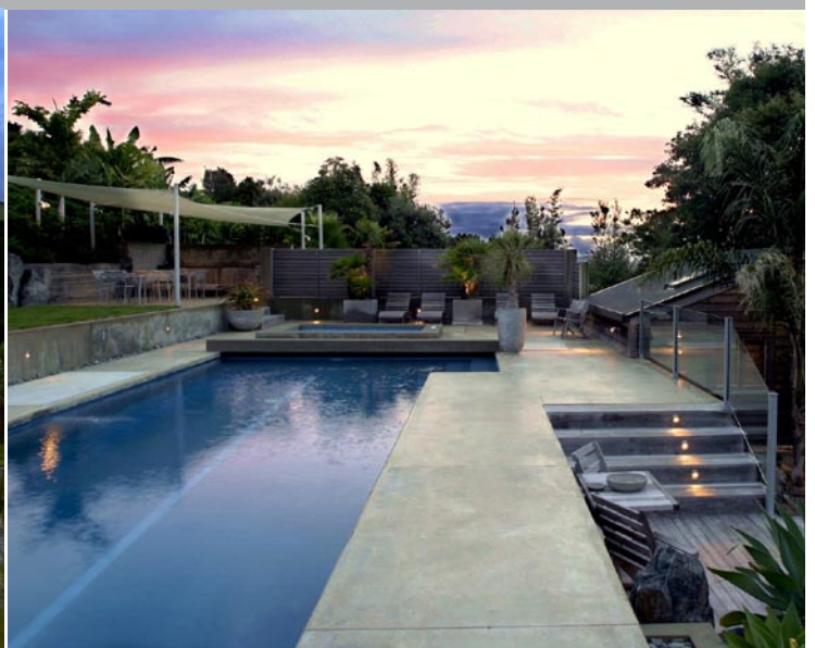
SACRED SPACE Four spacious bedrooms make this one of the biggest of the Eagles Nest villas. Enjoy the sunset from the infinity pool on the spacious outdoor decking or relax in the sauna