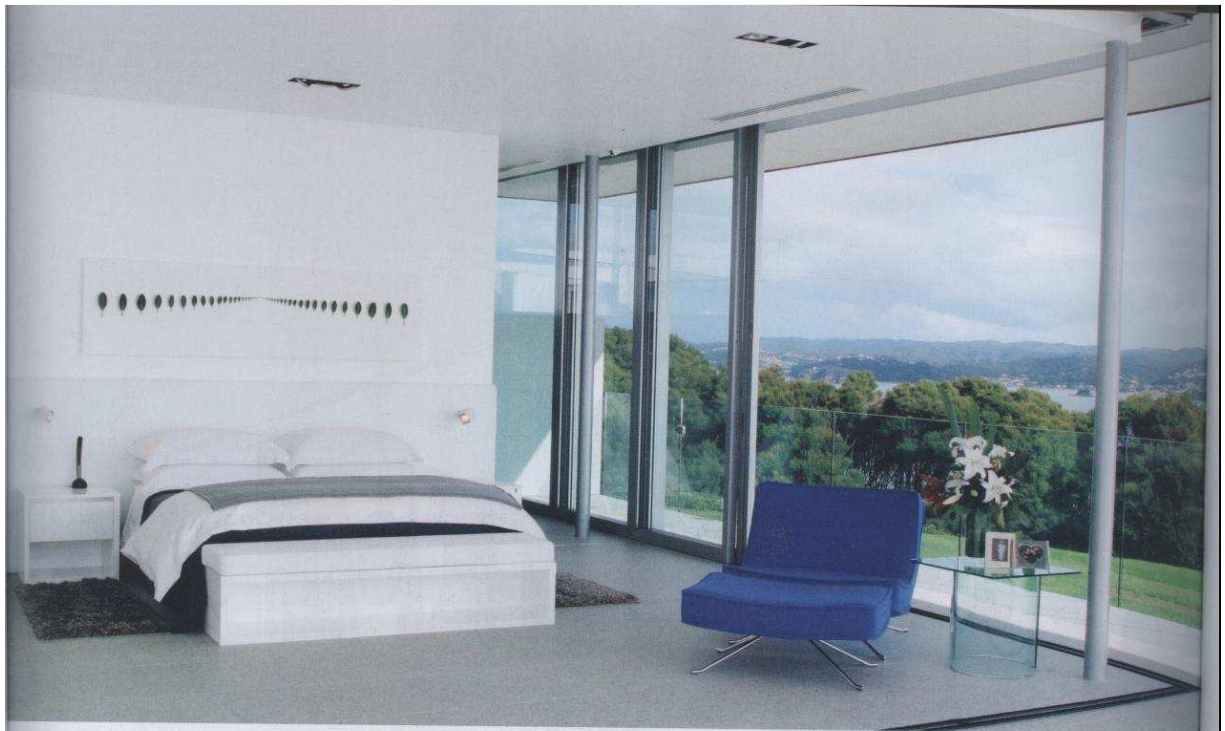
"The house's position and the land it is on are so special, we wanted to create something that in a hundred years will still get people to think 'wow,'" says owner Daniel Biskind. The crisply minimalist master bedroom overlooks the grounds and bay, and the fireplace in the atrium is made of crushed Japanese glass.